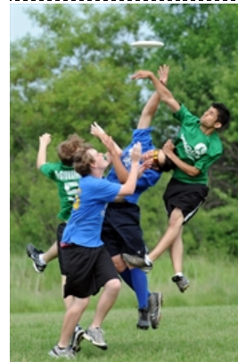
The Erindale Raiders (green) and Port Credit Warriors (blue) played a closely-fought game in the first ever ROPSSAA Ultimate Frisbee Championship at Cawthra Park Secondary School on Tuesday. Port Credit squeaked out a win and took the trophy.