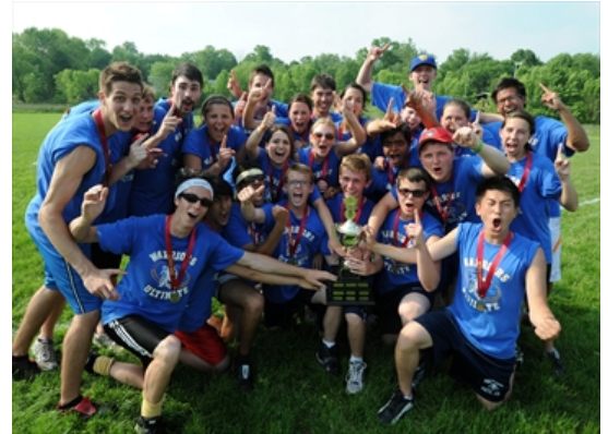
The Erindale Raiders and Port Credit Warriors played a closely-fought game in the first ever ROPSSAA Ultimate Frisbee Championship at Cawthra Park Secondary School on Tuesday. Port Credit squeaked out a win and took the trophy.